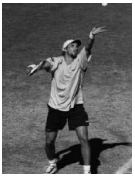
Rafter is a master of the serve and volley

means of developing and maintaining the skills that are required to play well on fast courts.