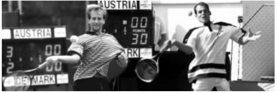
The beginning of the direct bitting movement in a topspin foreband.

The coach has to know how to vary drills to provoke adaptation of basic programmes. In encouraging his player to execute strokes with depth, placement